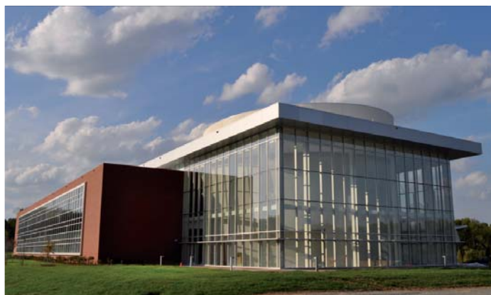
Joint School of Nanoscience & Nanoengineering

Aerospace • Automotive • Textiles Chemical, Analytical, Physical Testing State of the Art Equipment Research and Consulting Services Emphasis on Quality